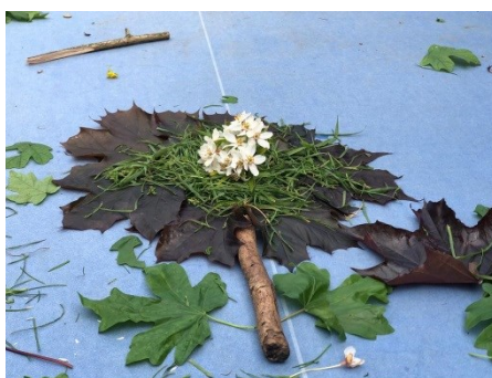
Class 3—Rainforest Terrariums